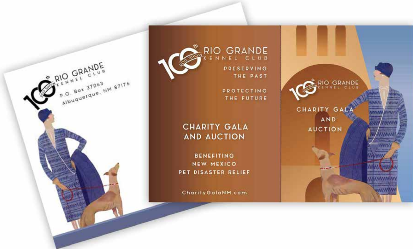
9 x 12 Presentation Folder and Mailing Envelope